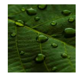
USE OF ECO FRIENDLY DYES & PIGMENTS