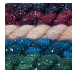
VARIOUS FANCY EFFECTS

Yarns produced with different value added fancy effects making them trend friendly and use of eco-friendly dyes enhances the value of yarn. From the customer point of view the fabrics/garments made from these yarns are with easy care.