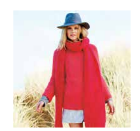
IDEAL FOR TRENDY CLOTHING