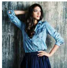
VARIOUS WASHDOWN EFFECTS